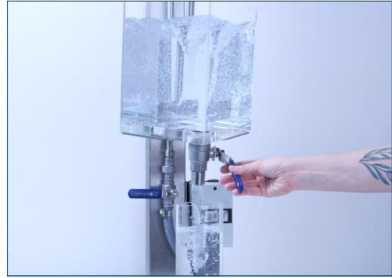
Fast and easy sample taking via ball valve

Fill the equalizer with the disintegrated sample and dilute the sample with water to a predefined level. Stir this solution constantly and take out a special amount by opening the ball valve (approx. 800 ml) each time you want to produce a sheet of paper.